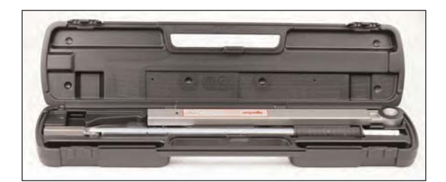
Split Industrial in Box.